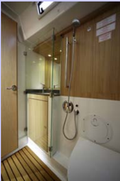
Shower of Cruiser 55